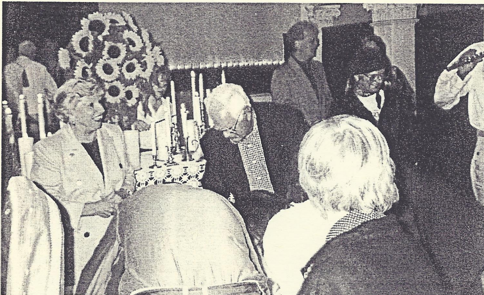
A United Religions Initiative charter signing ceremony was held this year in October at the Interfaith Center's annual Gathering of Blessings.

There followed three years of fundraising, organizing, and lobbying, with SFIC taking a lead role and providing fiscal agency to the venture. In September 1995 the Interfaith Center at the Presidio was incorporated, and in March 1996 the Center was invited to occupy the Main Post Chapel.