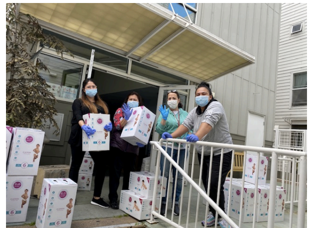
Staff preparing for diaper giveaway at our weekly distribution days.